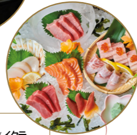
7 Sashimi Platter