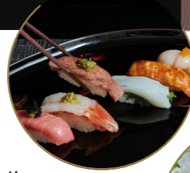
6 Nigiri Platter